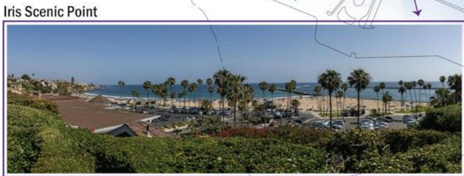
Iris Scenic Point