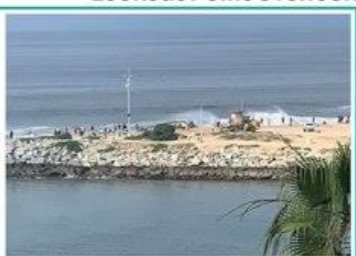
Lookout Point Overlook