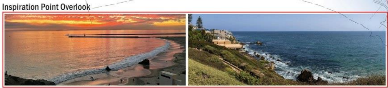
Inspiration Point Overlook